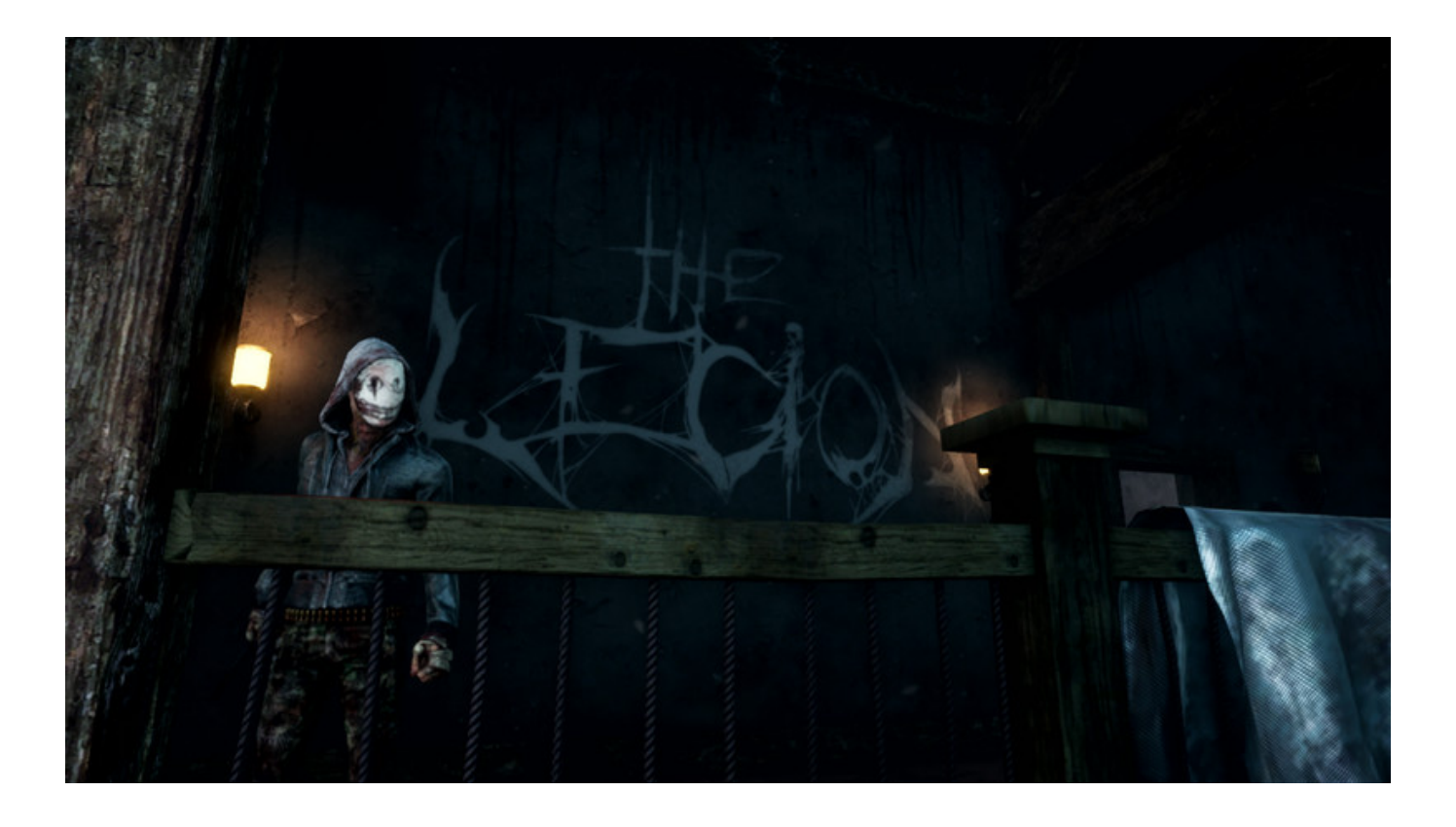
Download ->>->> <a href="http://bit.ly/2NHglvP">http://bit.ly/2NHglvP</a>